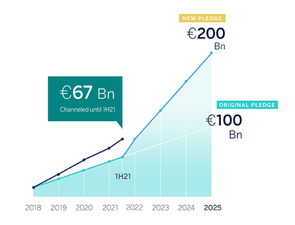
Our new pledge positions BBVA among the top banks in sustainable finance commitments